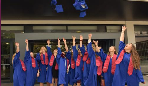
"Europubhealth brought the world to me in one classroom"

Europubhealth has been recognized as an Erasmus Mundus Joint Master Degree of Excellence and supported by the Erasmus+ programme of the European Union since 2006. More than a decade after its launch, the programme now enjoys a vibrant international network of public health professionals and academics, and more than 435 graduates of 86 different nationalities.